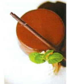
SHIP SHAPE! From top: Ocean Prime’s nautical theme is carried throughout the restaurant; peanut butter pie has quickly become a crowd pleaser.

Looking out over the downtown skyline from an urban sidewalk atmosphere, the terrace is Dallas’ newest scene. So go ahead, get primed. ■